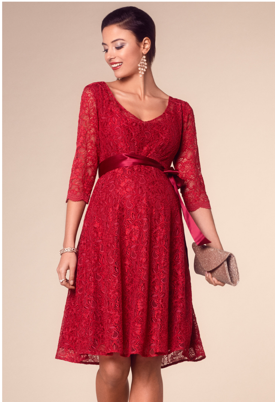
FREYA DRESS SCARLET