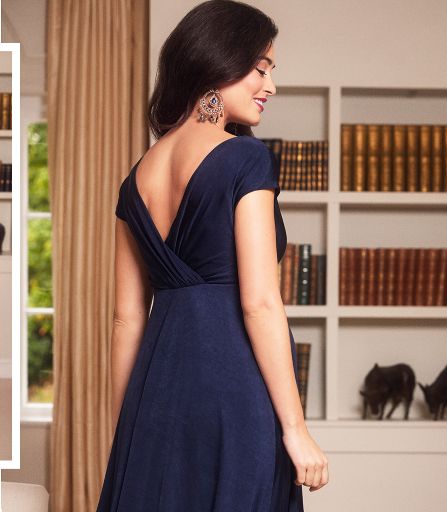
ALESSANDRA DRESS NAVY