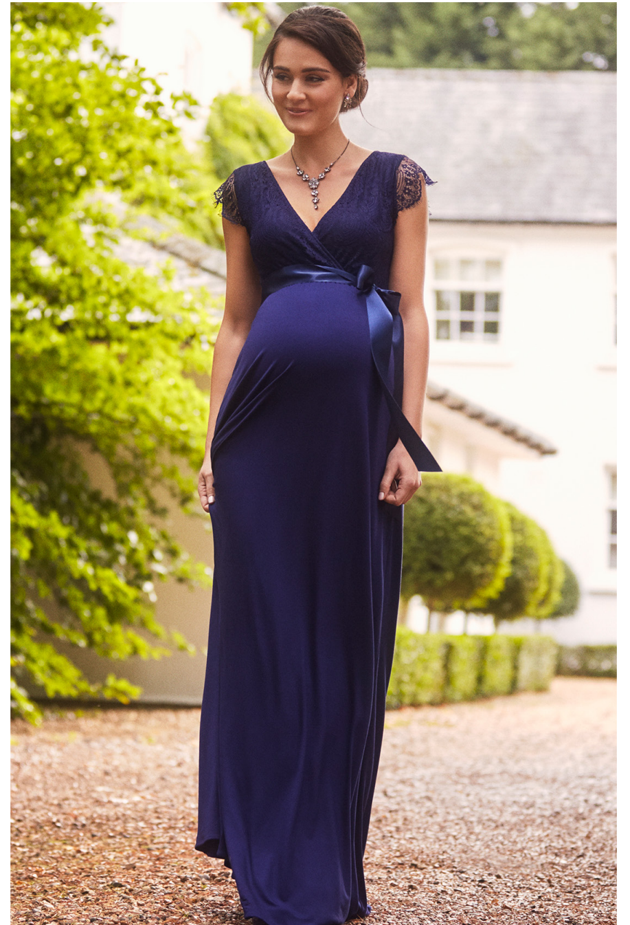
ROSA GOWN LONG INDIGO BLUE