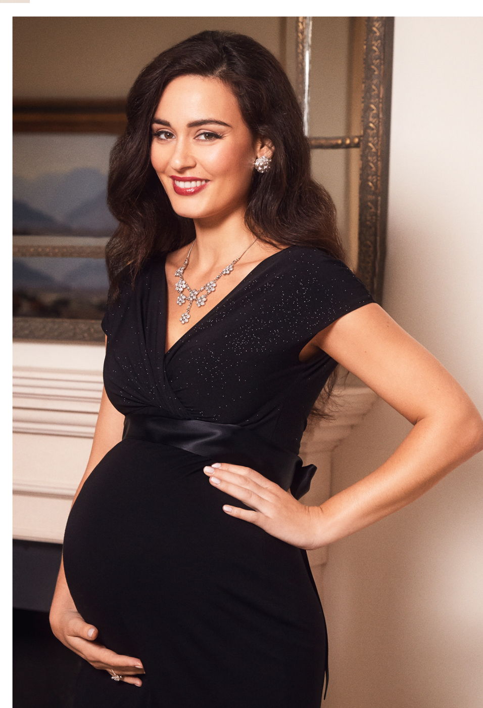
BARDOT SHIFT DRESS NIGHT SKY