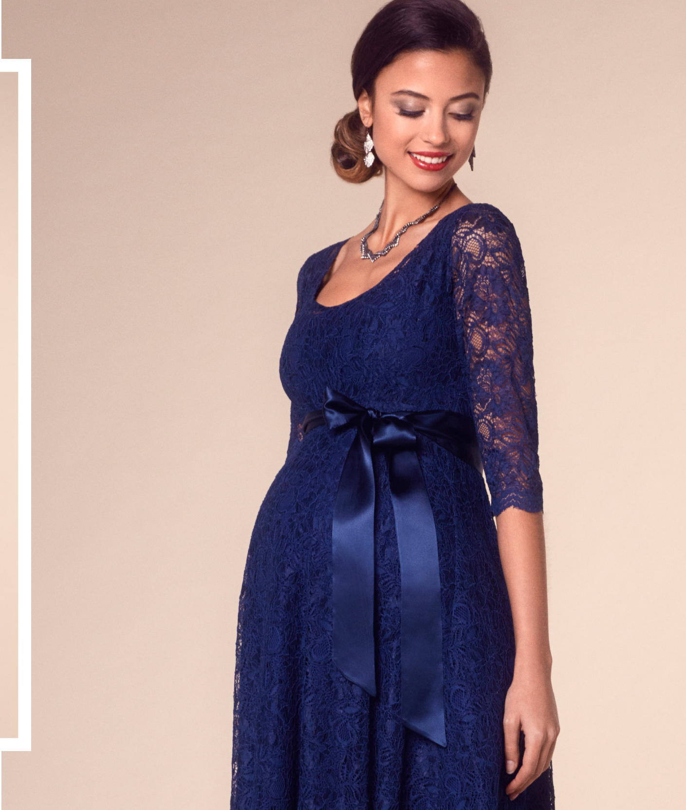
FREYA DRESS ARABIAN BLUE