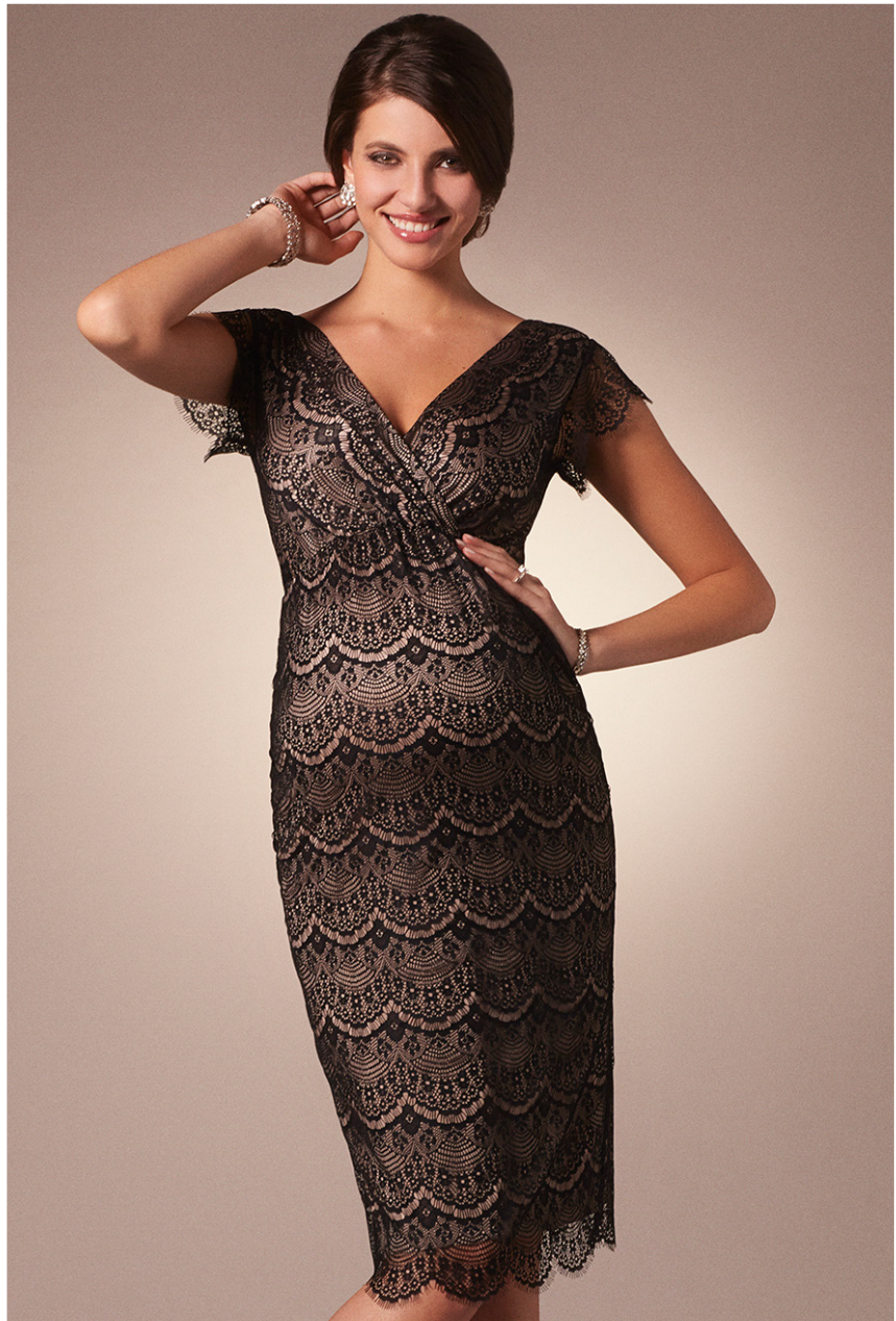
IMOGEN DRESS BLACK