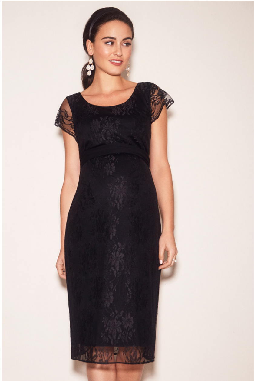
APRIL NURSING DRESS