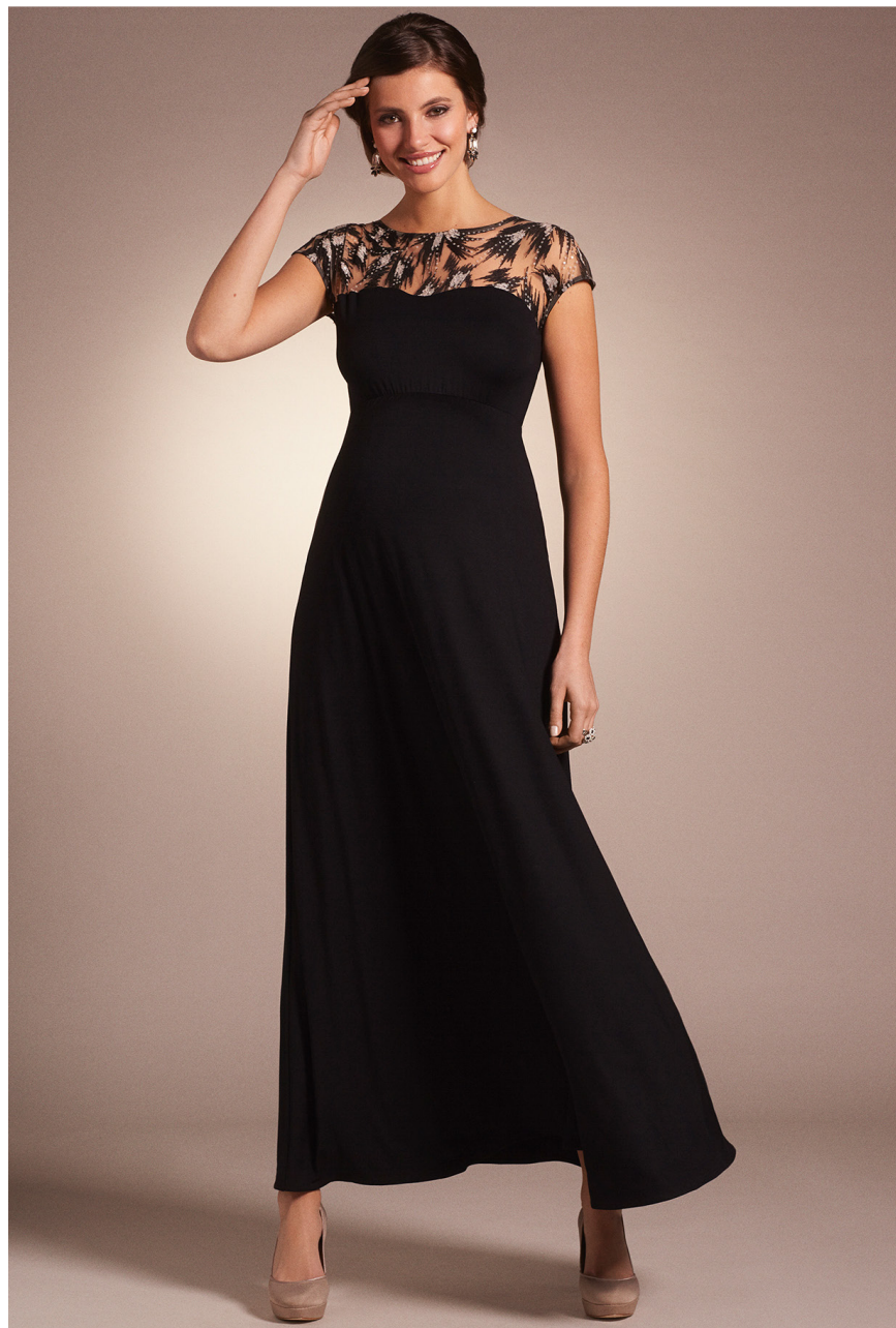
MARIE GOWN VINTAGE NOIR