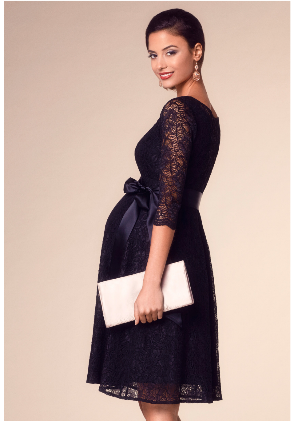
FREYA DRESS BLACK